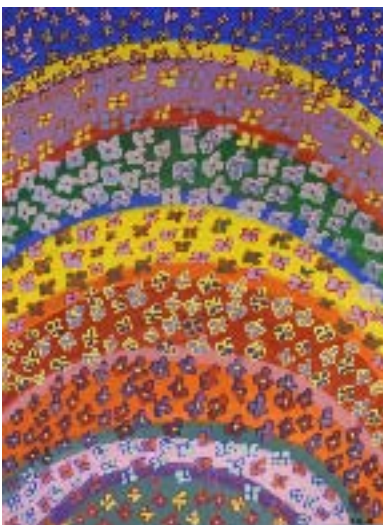
“Raining Flowers” Acrylic on Canvas by Amber Harriman

In-Definite Arts is proud to again partner with Stage Left Productions to present Balancing Acts 8, Calgary’s premier disability arts festival. The festival starts with a kick-off party and silent auction at Art Central, located downtown at the corner of Centre Street and 7th Avenue. The kick-off party is on Saturday, November 29 from 7-9 pm and everyone is welcome to attend this free event!